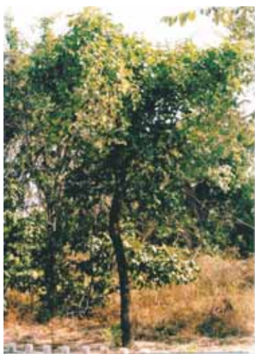
Strychnos potatorum – a 15-year-old mature tree

Flowers are rather large, white, arranged in short, nearly sessile, axillary cymes, with very short peduncles and pedicels. Fruit is a berry, black when ripe, globose, 1–2 cm in diameter, whitish, shining, with short adpressed yellow silky hairs. Seeds are globose in shape. Population of nirmali is depleting fast due to self-non-generative mechanism in fruits. They are often decayed and are prone to fungal attack as soon as they fall. Flowering occurs in September–October, while fruiting occurs in December.