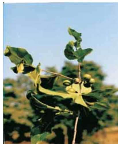
Strychnos potatorum – fruit-bearing twig