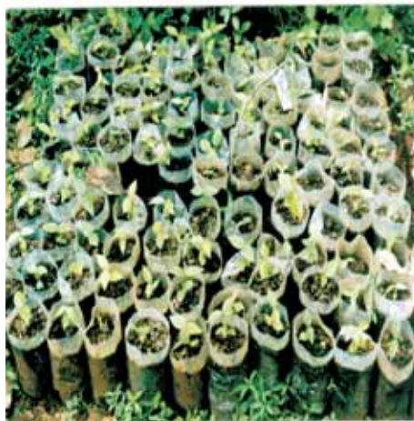
Strychnos potatorum – seedling establishment in polybags